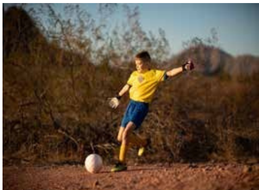
JUST KICK IT SOCCER - Founder

Welcome to the JUST KICK IT SOCCER program. JUST KICK IT promotes individual player development with the hopes that every player has a chance to be a playmaker. These rules have been intentionally developed and tested with the intention of matching high school rules as much as possible, while still considering player safety and development. These rules are intended to promote proper instruction, and to form strong fundamentals for the next level of soccer competition. We encourage you not to only read these rules, but to promote sportsmanship in the league, always keeping the spirit of team work and camaraderie in mind. This is not the MLS: these are kids, coaches are volunteers. Officials are human, and a positive player experience is not hinged on the outcome of any single contest. Remember, kids come first here, period. Poor behavior will not be tolerated. Please ensure that every player gets fair playing time, and encouragement.